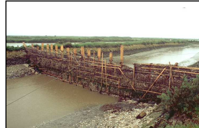
Oyster shell dam